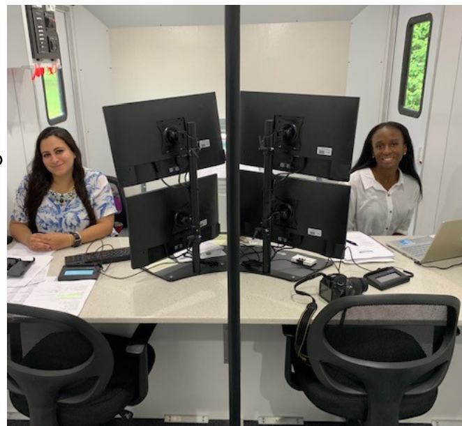
Case workers from Family Promise and county health services working side-by-side on mobile van using Single Stop Technology.

Single Stop streamlined the high case load for case workers who constantly juggle multiple tasks. Case managers used to spend hours finding resources that rural clients could access. Now, they use Single Stop's local resource tool to easily find referral agencies with a simple zip code search. Using data collected by Single Stop technology, Family Promise was able to advocate for rural clients with the county benefits office. They used data to show that eligible rural communities were not applying for benefits due to lack of transportation and long travel times. Working together with county officials, Family Promise now travels the county giving mobile screenings with Single Stop technology and providing application assistance on the go.